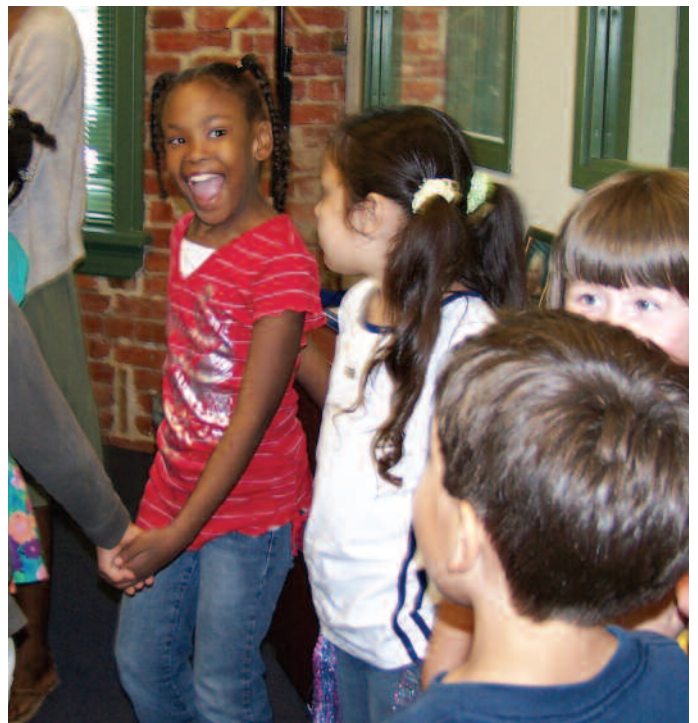
Future customers—students from the E.L. Haynes Public Charter School

Capital City Public Charter School Centronia Charter School Development Corporation Community Foundation of the National Capital Region Cooperative Assistance Fund Cornerstone, Inc. East River Park/Marshall Heights CDC Enterprise Community Partners Government of the District of Columbia HOK/Devroux & Purnell Horning Brothers House of Ruth Leviticus 25/23 Fund Meridian Public Charter School Metropolitan Washington Airport Authority National Cooperative Bank, FSB Paul Junior High Public Charter School Teaching for Change Two Rivers Public Charter School Thurgood Marshall Academy Public Charter School Washington Area Community Investment Fund Washington Latin Public Charter School WC Smith and Company